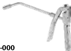
Art. 014-1082-000 Grease control gun with rigid pipe and 4-jaws coupling Length rigid pipe: 200 mm Swivelling joint F 1/4"