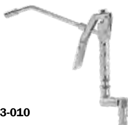
Art. 014-1083-010 Grease control gun with rigid pipe and 4-jaws coupling Length rigid pipe: 200 mm Triple-swivelling joint F 1/4"