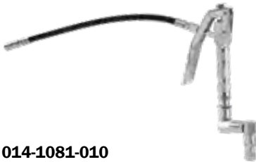
Art. 014-1081-010 Grease control gun with flexible hose and 4-jaws coupling Length flexible hose: 400 mm Triple-swivelling joint F 1/4"