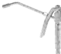
Art. 014-1083-000 Grease control gun with rigid pipe and 4-jaws coupling Length rigid pipe: 200 mm Swivelling joint F 1/4"